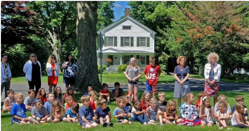
Children from the Burnham Elementary School gather next to the dedication ceremony in Bridgewater.