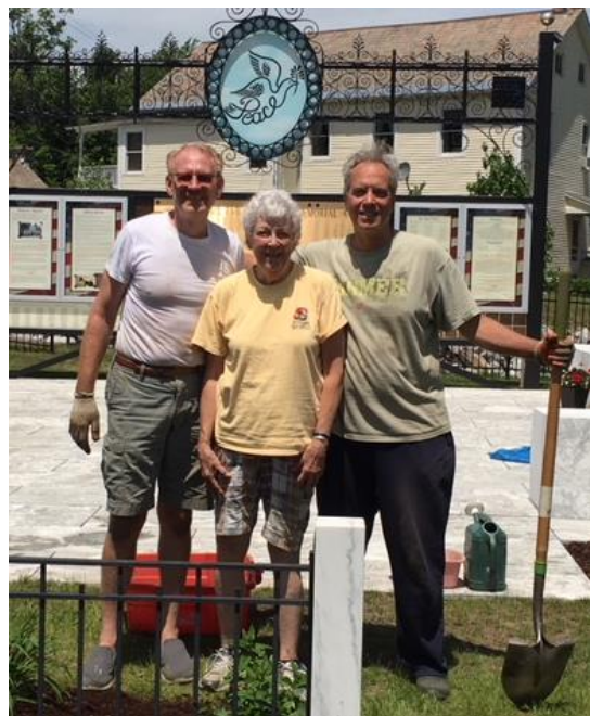
Work on memorial this summer