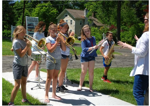
A group of children from the Burnham Elementary School in Bridgewater played "This Land is Your Land"