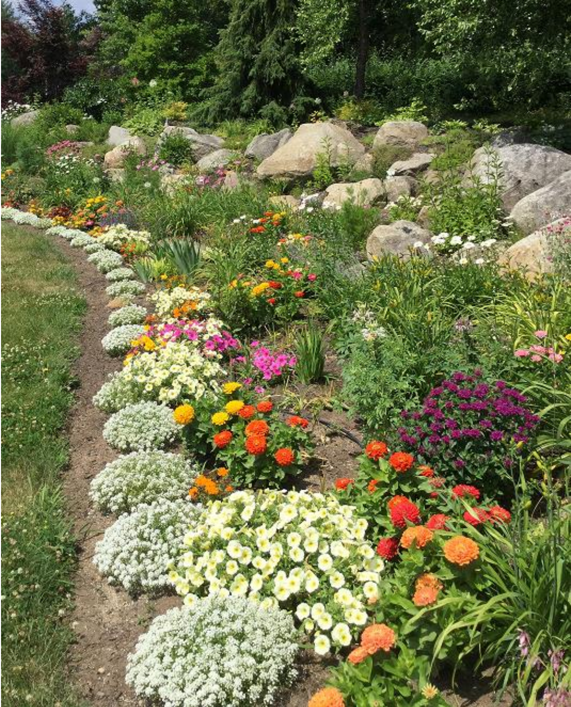
The Bow Garden Club's (NH) community garden, now thriving with the application of Espoma products and their members' TLC.