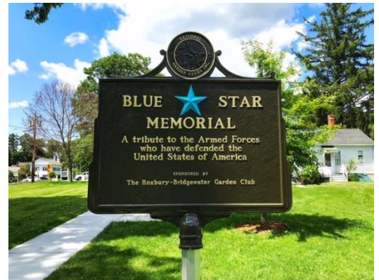
The Memorial Marker by the Roxbury-Bridgewater Garden Club.